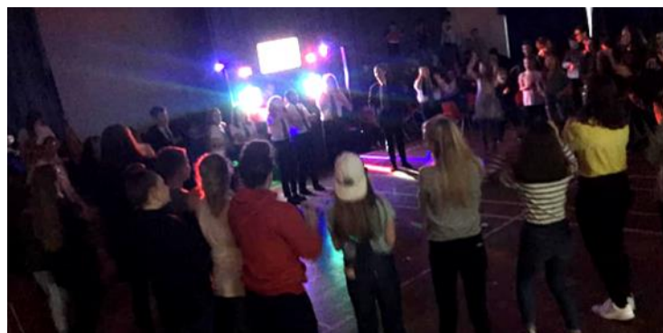
Year 7 and Year 8 enjoying the Christmas Disco organised by the PTA